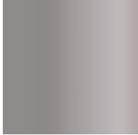
Matte White Lacquer - MWL